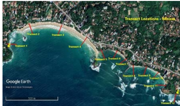
Figure 2: Shore normal transect locations

The beach was in three states, according to the data analysis: erosion, accretion, and steady state. Additionally, the majority of transect locations exhibit a similar beach state, which is favourable for the development of the tourism industry.